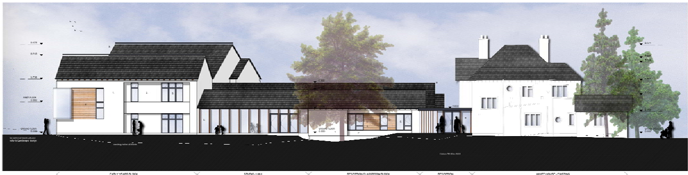
1 Elevation 1 1:100

NOTE: To be read in conjunction with landscape design GENERAL NOTES Copyright of this drawing is vested in the Architect and it must not be copied or reproduced without consent. Only final dimensions are to be taken from this drawing. All contractors must visit the site and be responsible for taking and checking all dimensions relative to that work. Notify the Architect immediately of any variation between drawings and site conditions. This drawing is based on survey information supplied from CSL Survey Group Ltd.