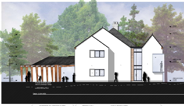
2 Elevation 2 1:100

NOTE: To be read in conjunction with landscape design GENERAL NOTES Copyright of this drawing is vested in the Architect and it must not be copied or reproduced without consent. Only final dimensions are to be taken from this drawing. All contractors must visit the site and be responsible for taking and checking all dimensions relative to that work. Notify the Architect immediately of any variation between drawings and site conditions. This drawing is based on survey information supplied from CSL Survey Group Ltd.