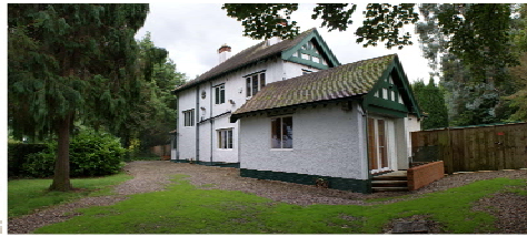
White House - existing front view